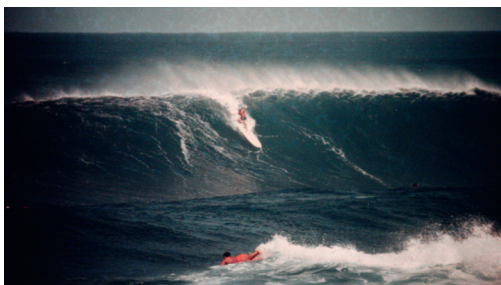
Felipe Pomar, Sunset Beach, 1972