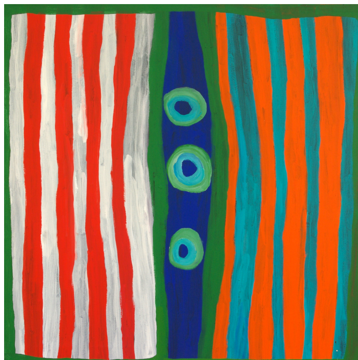
Kurtal-Living Water by Jukuja Dolly Snell Atelier acrylic paint on 14oz canvas 120cm x 120cm