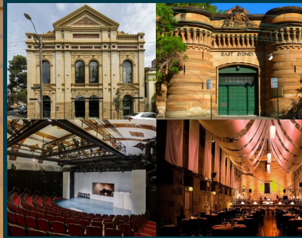
Clockwise from top left: Darlinghurst Theatre & Darlinghurst Gaol facades; the Theatre's auditorium; the Cellblock at night.

As any previous conference attendee knows, the Conference provides an excellent opportunity for