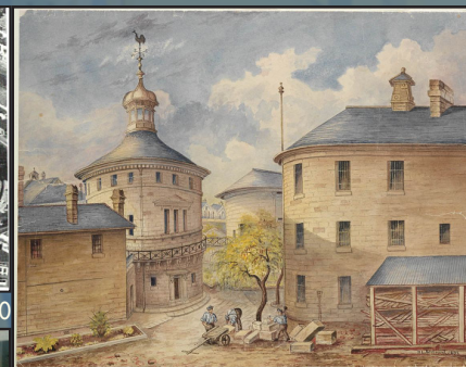
Watercolour of Darlinghurst Gaol, 1891