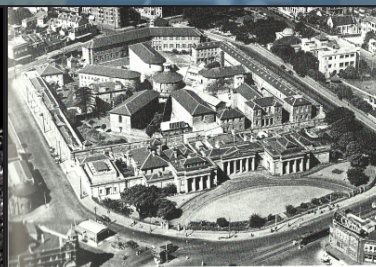
Image of Darlinghurst Gaol, 1930