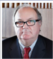
The Honourable Justice Patrick Keane , High Court of Australia