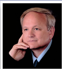
Judge Jeffrey Howard , Chief Judge, First Circuit, United States Court of Appeals