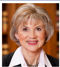
The Right Hon Beverley McLachlin PC , Chief Justice of the Supreme Court of Canada,