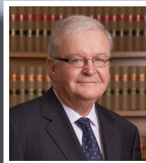
The Hon Tom Bathurst AC , Chief Justice of New South Wales