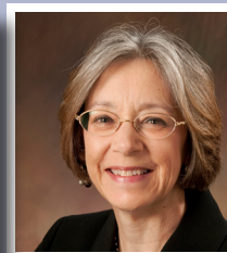
Chief Judge Diane Wood , Seventh Circuit, US Court of Appeal