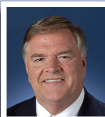
The Hon Kim Beazley, AC , Australian Ambassador to the USA