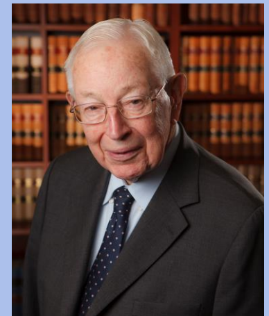
The Hon Sir Anthony Mason AC KBE GBM QC

Attorney-General of Australia (1958-64) Minister for External Affairs (1961-64) Chief Justice of the High Court of Australia (1964-81)